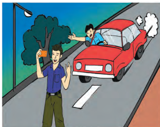
9.7 Selfie on Road