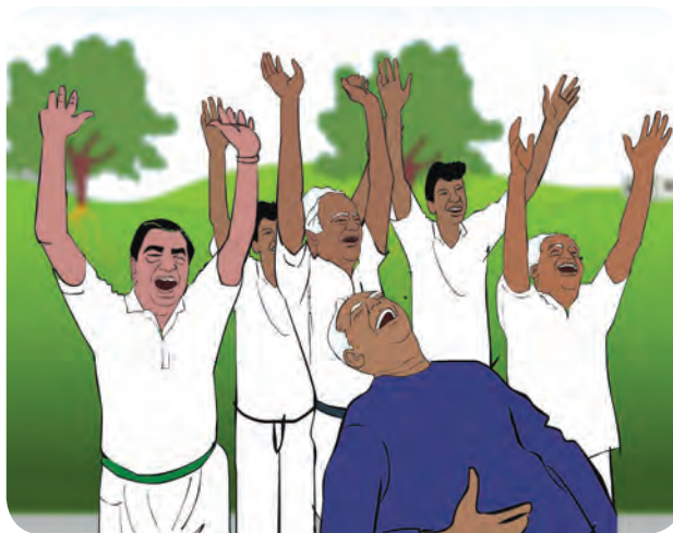
9.10 Laughter Club

Fostering the hobbies like material collection, photography, reading, cooking, sculpturing, drawing, rangoli, dancing, etc. help us to properly utilize the free hours. By diverting the energy and mind towards the positive thinking, negative thoughts are automatically neutralized.