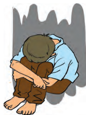
9.2 Mental Stress

Competition has increased in opportunities for education, employment and business due to increase in population. Children are facing the problems of loneliness and mental stress due to reasons like nuclear family and parents staying outdoors due to job. There are many bindings on girls and excessive freedom for boys in some families. Boys enjoy the concession from their domestic duties whereas girls have compulsion for the same on the pretext that 'should be used to it'. Do you see the advertisements about increasing awareness on avoiding the discrimination between girls and boys or sister and brother in same family on choice for fresh/left-over food, learning medium? In society too, adolescent girls have to unnecessarily face the problems like teasing and molestation. Girls are facing the problem of stress due to such gender inequality.