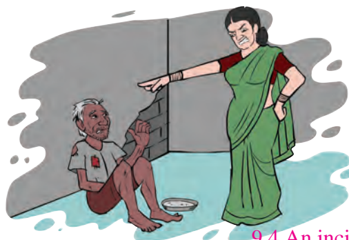
9.4 An incidence

Whether the incidence shown in the following picture is rational? Express your opinion.