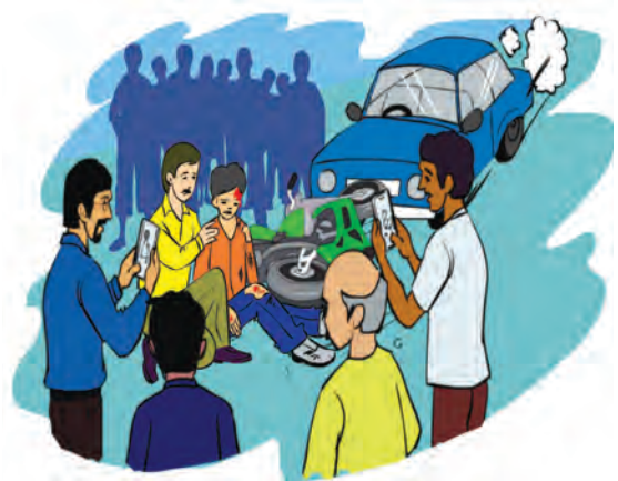
9.8 Pedestrian making a video-clip of the accident scene

Person indulging in selfie is not aware about the world around and the risks. This is called as selficide. Persons indulging in domestic violence, sending messages to others before committing suicide or those who send the video clips of suicidal act are mentally ill and they do so to win the sympathy.