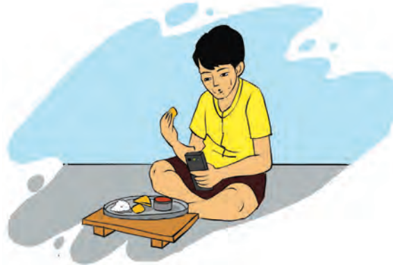
9.6 Boy using cell phone while eating