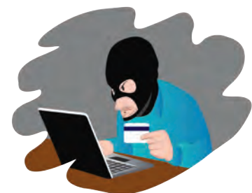
9.9 Cheating of Consumers