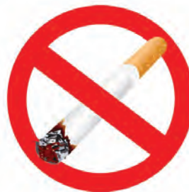
9.3 Addiction control